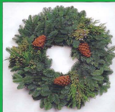
Noble Fir Mixed Wreath 20"*, 36" & 48" Indoor/Outdoor