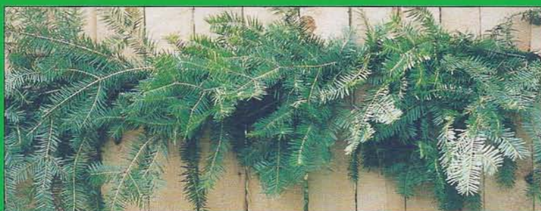
25' Balsam Fir Garland Cedar & Noble also Available