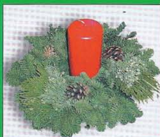
12" Candle Ring Wreath with 4" Candle