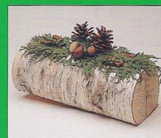
Holiday Yule Log 12"