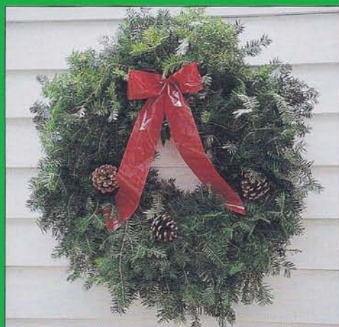
Single Face Balsam Outdoor Wreath 26", 36", 48", 60", 72" Double Face Balsam 36"